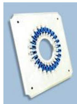
PH55-PL-24 LC/PC 24 connector fixture