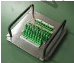
PH55-CP8A-32N SC/APC 32 connector fixture

Mega-axis I.P.C. Fixtures are available as well for FC, SC, ST, MU, & LC Up to 48 connectors polishing at once